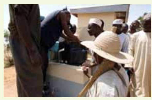
Above SBMC create a platform for community members to contribute to school improvement.