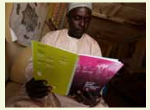
ESSPIN-supported SBMC Policy Guidebooks, now a model for SBMC development in 36 states of the dederation.