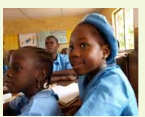
Left Teaching and learning are improved in schools where SBMCs monitor activities of teachers and pupils.

SBMCs are monitored by their CSO and government mentors against performance indicators based on SBMC policy guidelines, using monthly reports integrated into the education system.