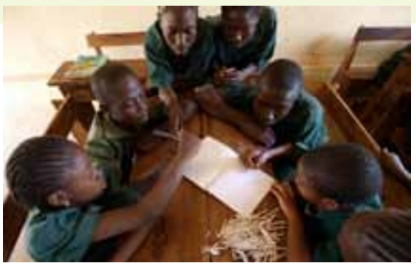
Left Community efforts through SBMC activities are helping enrol more out-ofschool children.