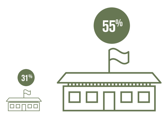
SIP schools are performing better than others, with 55% meeting the school quality benchmark, compared to 31% in other schools.