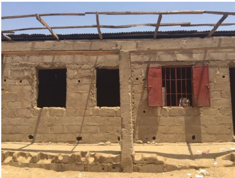
Newly constructed block of three classrooms at Chiranci Gabas Primary School