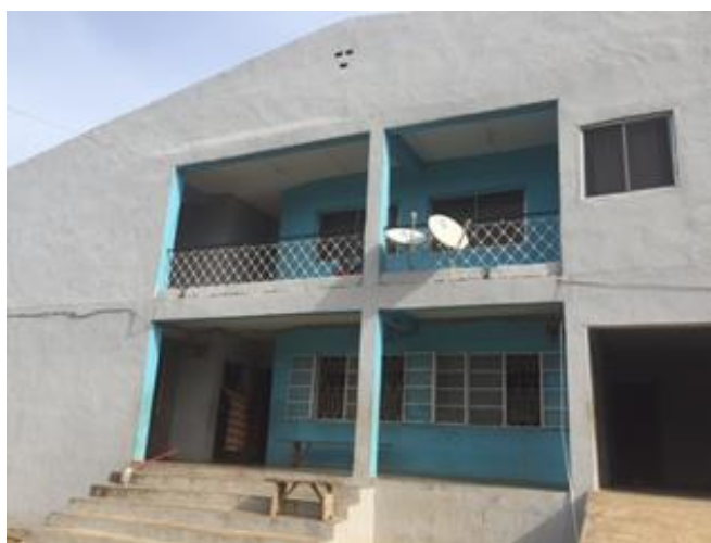
Hostel built by ECWA church for ECWA primary school