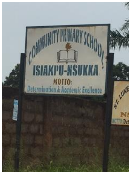
Sign Post Funded by the Igwe