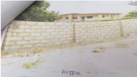
Collapsed fence – After