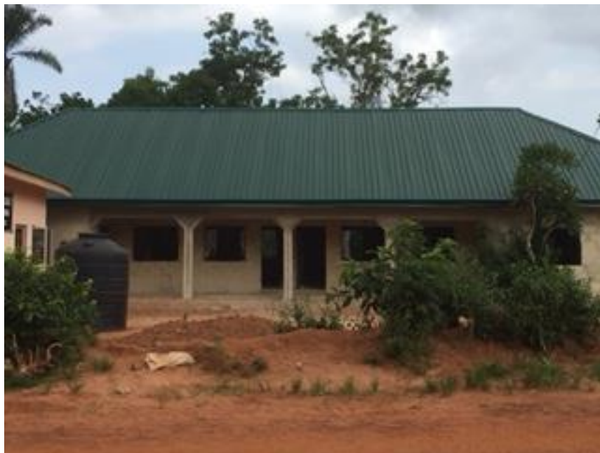
Additional classrooms constructed by Igwe N.P Oleje Chinenye Eze 1 of Uwani Amokwe