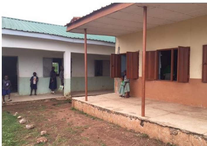
The white block is the special needs school on Taodeen school grounds

48. The families of pupils at Iyeru Okin special needs school are very happy about the land acquisition as it would mean that their children who are physically and mentally challenged can learn in a private and more spacious area where they can feel free to be themselves. The pupils are also glad about the new development. Since enrolment most of the pupils are now able to read and write. Their general behaviour has also tremendously improved.