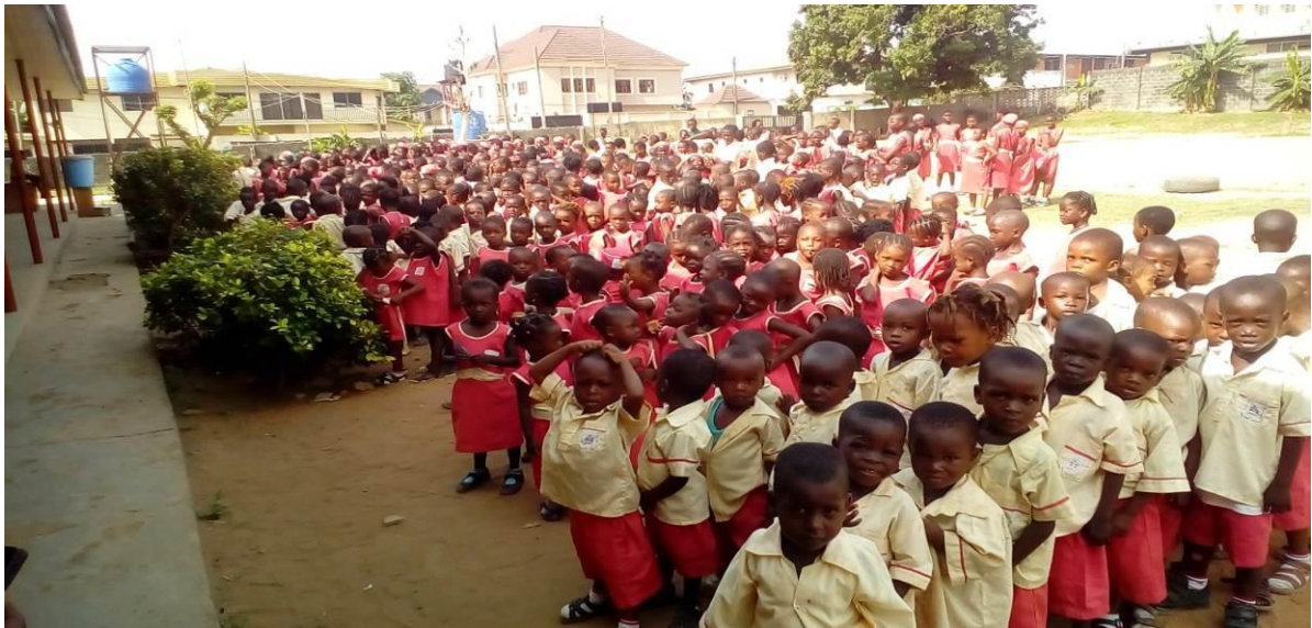
Pupils at Anthony Model Primary School looking bright during morning assembly following re-construction of the fence