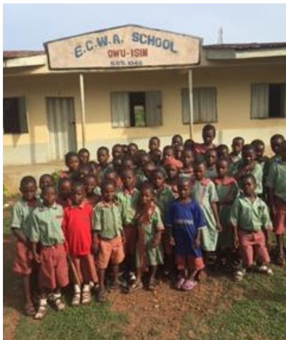
ECWA school boarding pupils(left)

the contribution of its members, built a hostel which accommodates 42 pupils (27 male and 15 female). The church has spent N220, 000 so far in the current construction of an extension for the hostel and also provided three vehicles to transport the boarding students from their homes in Ekiti state to school and back home at the end of term.