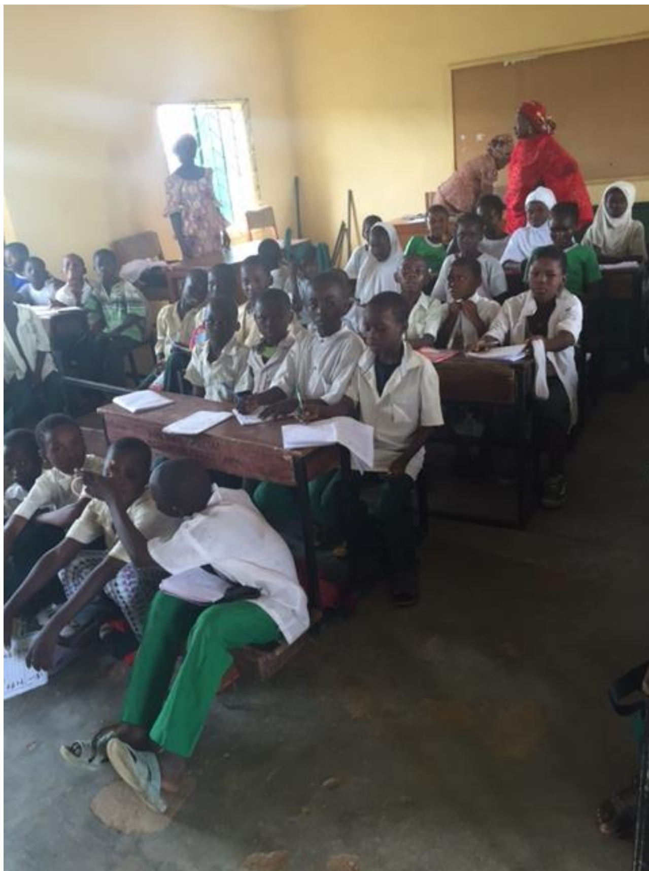
Pupils in class at Railway primary school