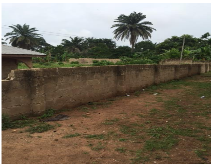
Fence built by Christ Apostolic Church for St James Primary School