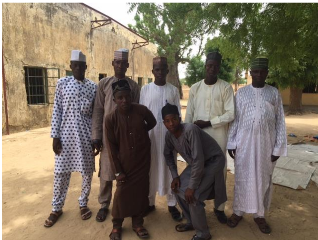
The Seven Volunteer Teachers Deployed at Dangyatum Special Primary School