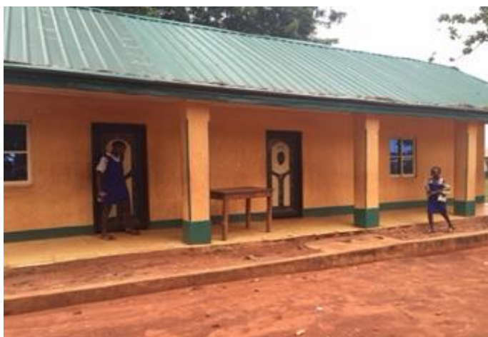
Newly constructed headmaster's office block