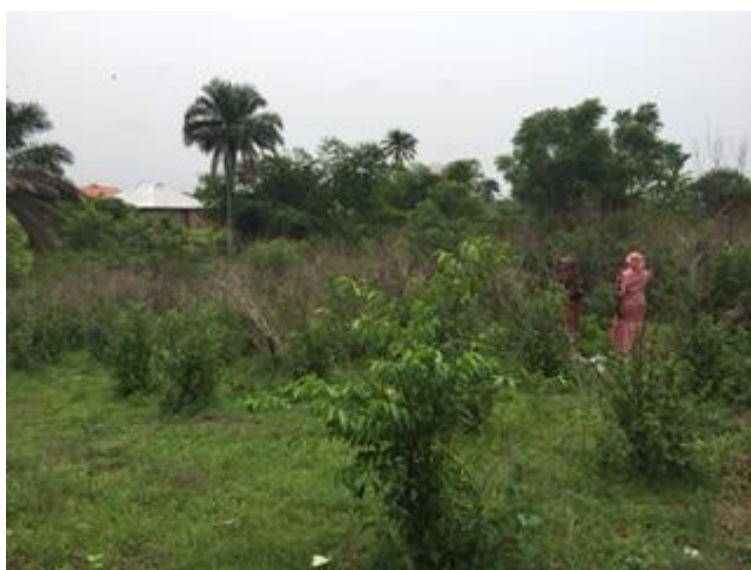
The land given to the special needs school on influence of the Imam