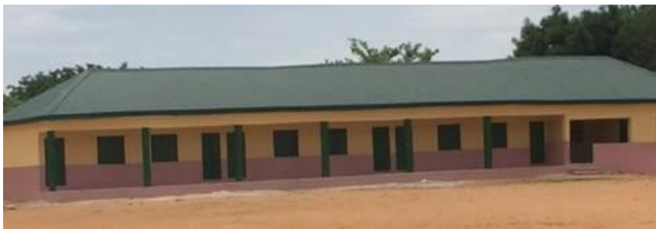
New Block of 3 Classrooms Built by SUBEB for JSS Students in Galadanchi Special School