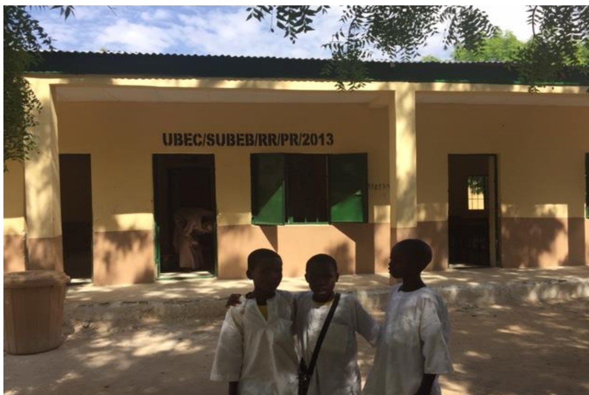
Newly Renovated SUBEB Block for Hammayayi Primary School