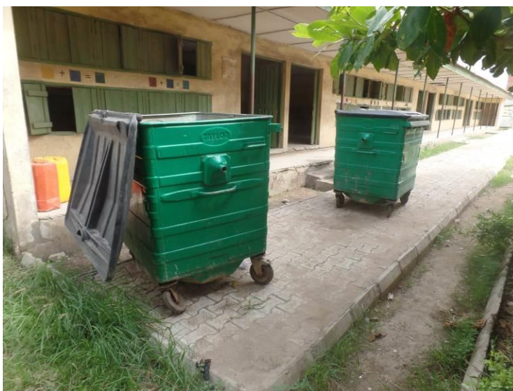
Emptied waste bins; Clean school environment