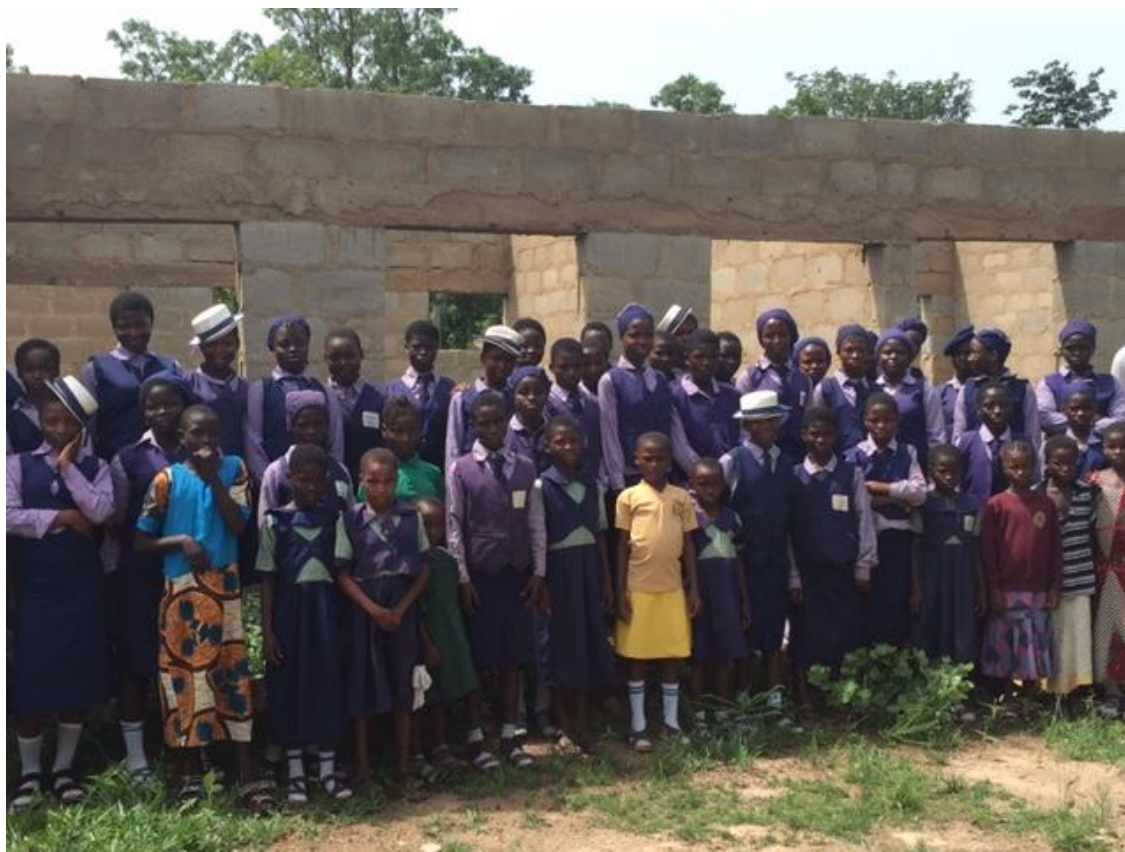
Boarding girls in front of the girls hostel built by Oba Ezra .D. Bamigboye