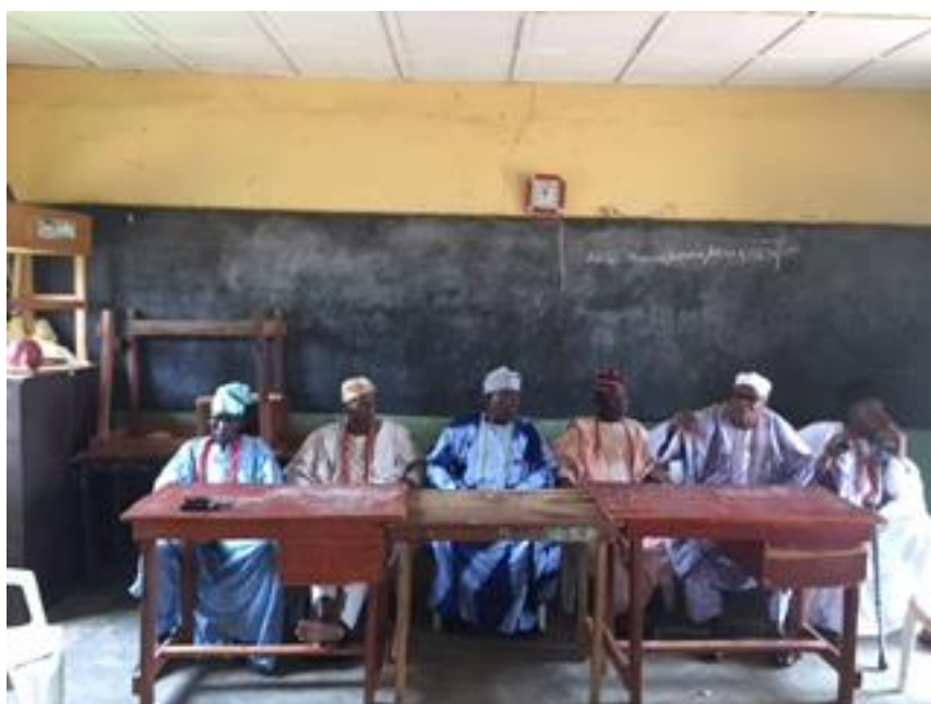
Traditional Rulers from the Various Wards of Offa LGEA during the interview