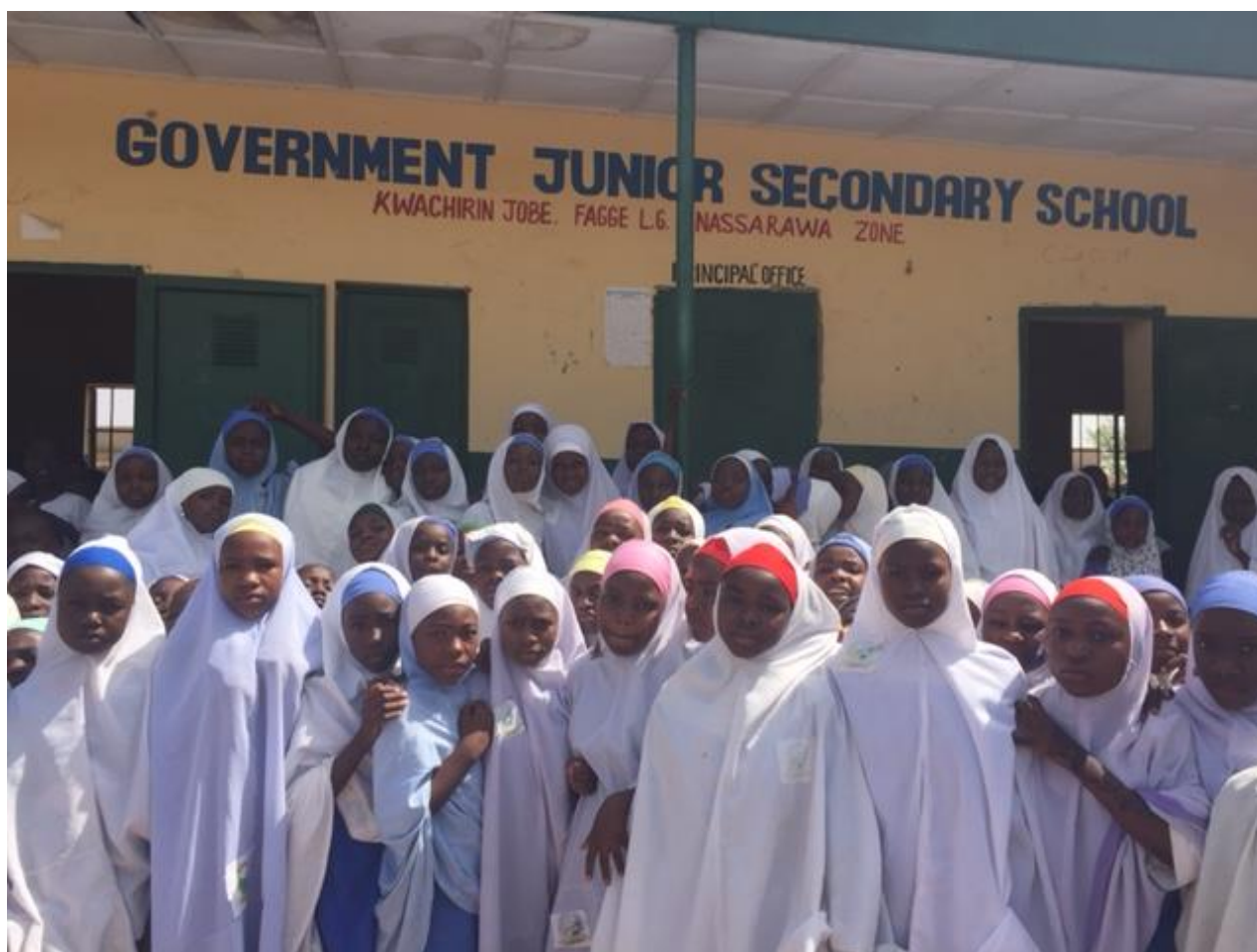
Kwachirin Jobe JSS1 and JSS2 students in front of their newly constructed classrooms.