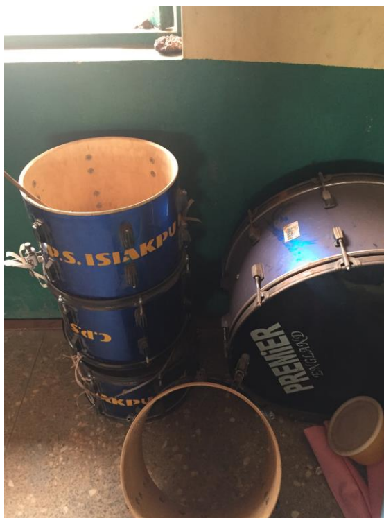
School band funded by the Igwe