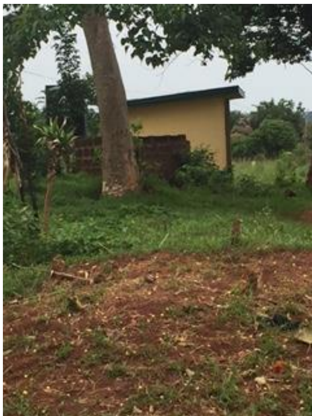
New toilet block