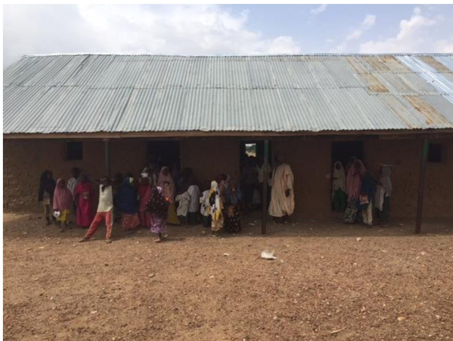
Reconstructed classroom block at UBE Primary, Mahangi