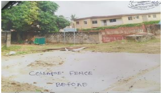
Collapsed fence- before