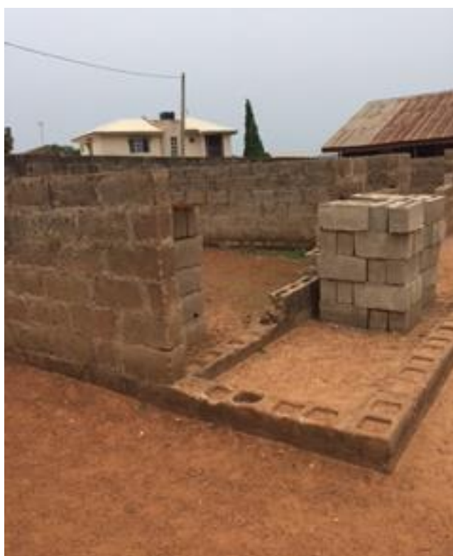
New Classrooms being constructed by the Muslim traditional ruler and Opwa Progressive Women's Association (right)